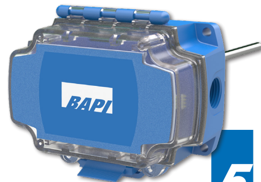
Wireless Duct Temperature Sensor

This unit features a rugged IP66-rated BAPI-Box enclosure and 1/4" (6.4mm) stainless steel probe with probe lengths from 4" to 18" (102 to 457mm).