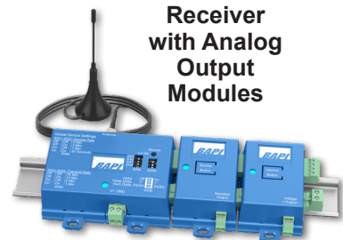
Receiver with Analog Output Modules

DIGITAL AND ANALOG OUTPUT MODULES - The BACnet IP Module converts the data from up to 28 sensors for integration into the management level BACnet IP network. The BACnet MS/TP or Modbus RTU Module converts the data from up to 28 sensors for integration into the field level BACnet or Modbus Network. The Analog Output Modules convert the sensor data to a voltage or resistance for the controller analog inputs.