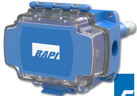
Wireless Duct Temperature and Humidity Sensor

This unit features a rugged IP66-rated BAPI-Box enclosure and replaceable stainless steel filter.