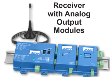
Receiver with Analog Output Modules

DIGITAL AND ANALOG OUTPUT MODULES - The BACnet IP Module converts the data from up to 28 sensors for integration into the management level BACnet IP network. The BACnet MS/TP or Modbus RTU Module converts the data from up to 28 sensors for integration into the field level BACnet or Modbus Network. The Analog Output Modules convert the sensor data to a voltage or resistance for the controller analog inputs.