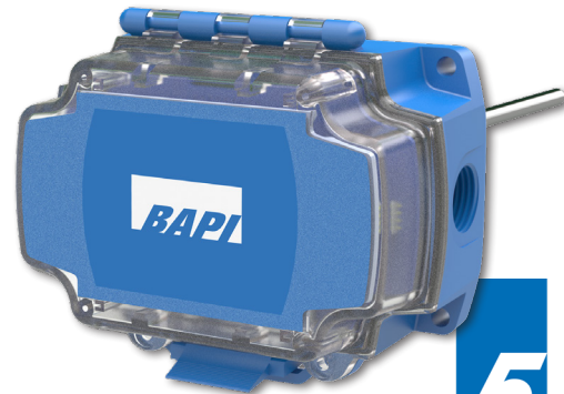
Wireless Duct Temperature Sensor

This unit features a rugged IP66-rated BAPI-Box enclosure and 1/4" (6.4mm) stainless steel probe with probe lengths from 4" to 18" (102 to 457mm).