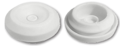
Top and bottom view of a Pierceable Knockout Plug

Pierceable Knockout Plugs are available for the open port in the BAPI-Box Crossover and BAPI-Box 4 Enclosure, as well as the non-threaded ports in the BAPI-Box, BAPI-Box 2 and Junction Box enclosures. The plugs will also work in panels with a metal thickness of 0.118" or smaller.